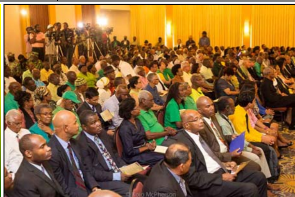
Right Photo: A section of the audience at the Media Launch at the Pegasus Hotel on the 4th March 2015.