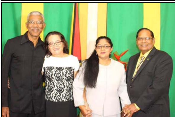
Left Photo: Presidential Candidate, Brigadier David Granger (left) and Prime Ministerial Candidate, Mr. Moses Nagamootto and their wives.